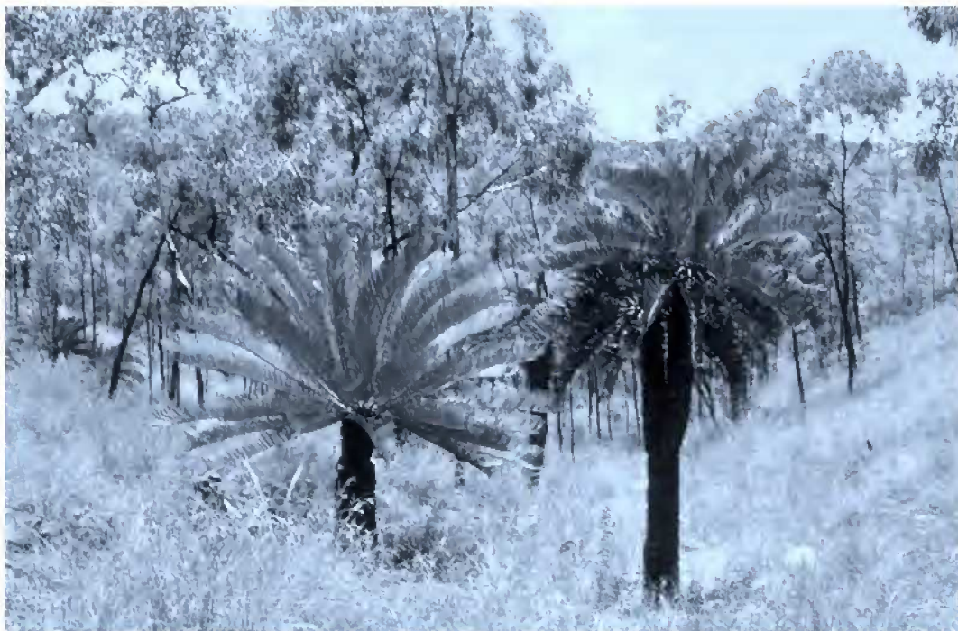
Fig. 2. Cycas cupida habit.